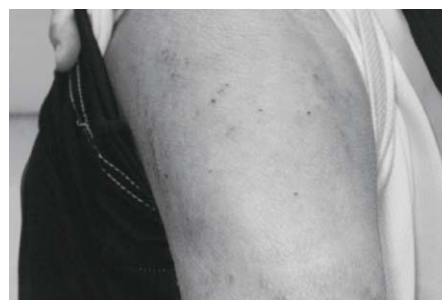
Fig. 3 Long term scratching caused lichening, multiple scars, and crust shown on patient's upper arms. (This photo was taken at the 9th subsequent visit)