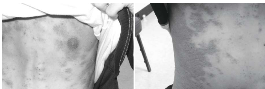
Fig. 1& 2 Erythematous papules were densely spread across the chest and abdominal regions. Lichening, multiple scars and crust were noted at the lesions. (This photo was taken at the 9th subsequent visit)

Coptis & Scute Combination (Huang Lian Jie Du Tang) 6g Anemarrhena, Phellodendron & Rehmannia Formula (Zhi Bo Di Huang Wan) 4g Morus & Lycium Formula (Xie Bai San) 4g Turmeric (Yu Jin) 1g Cyperus (Xiang Fu) 1g Rhubarb (Da Huang) 2g Magnolia bark (Hou Po) 0.5g 4 times/day × 14 days